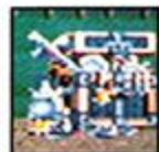
CHEST OF JEWELS

Mountains of gold and treasures beyond belief lie on the road to the Grail. Smash open barrels and pick up the gold or smash the chests open to evenly divide up the booty between the knights.