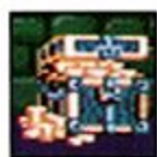
CHEST OF SILVER

A player adds 600 experience points to his total.