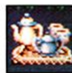
SILVER TEA SET

A player adds 400 experience points to his total.