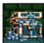
CHEST OF GOLD

A player adds 800 experience points to his total.